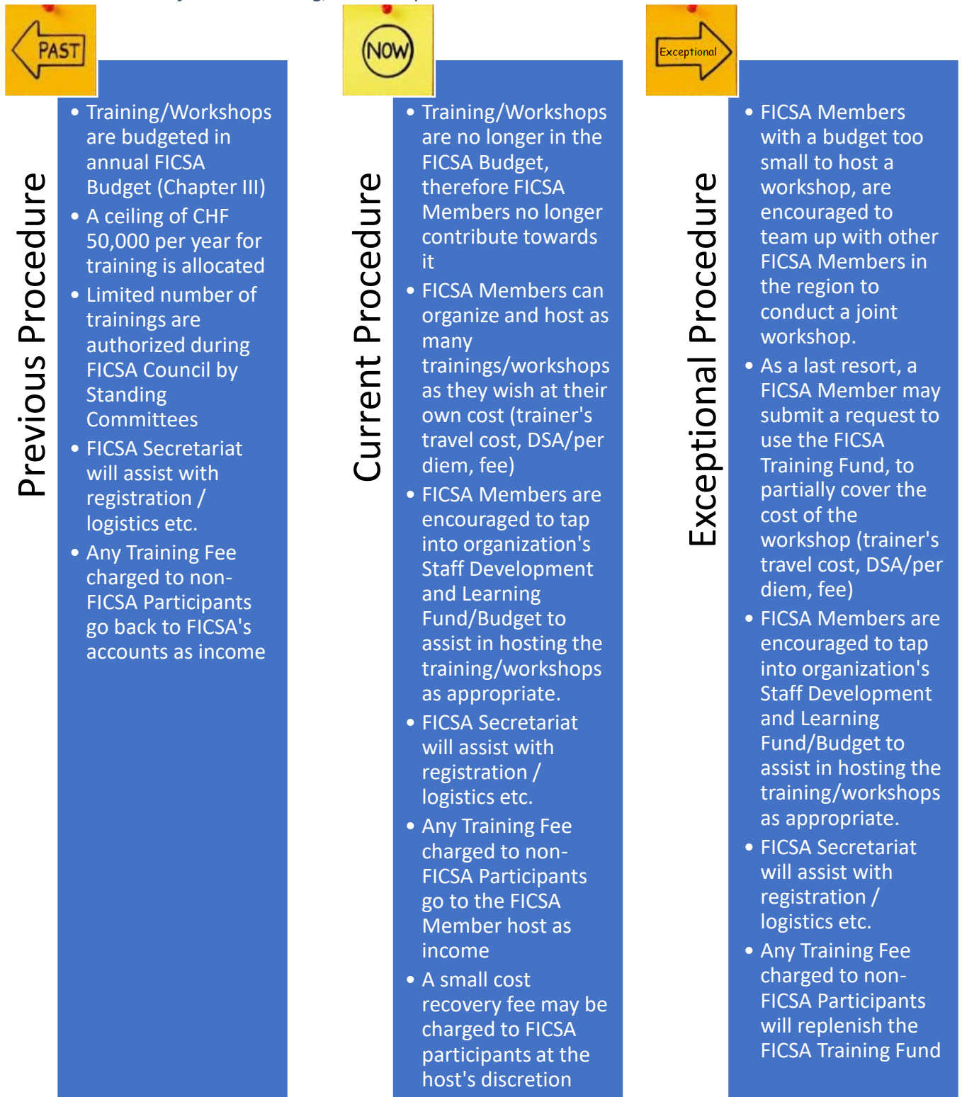
Table 1- Evolution of FICSA Training/Workshop Procedure